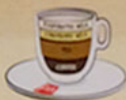
Yuan Yang (Coffee with Tea)