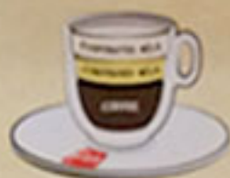
Kopi + C