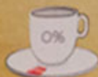
Kosong (Zero Sweetness)