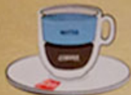
Kopi O (With Sugar)