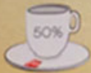
Siew Dai (Less Sweet)