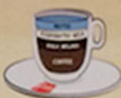
Gula Melaka Kopi (With Palm Sugar)