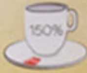
Ga Dai (Extra Sweet)