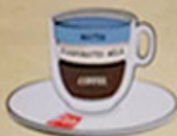
Kopi C (With Sugar)