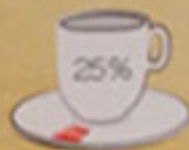
Siew Siew Dai